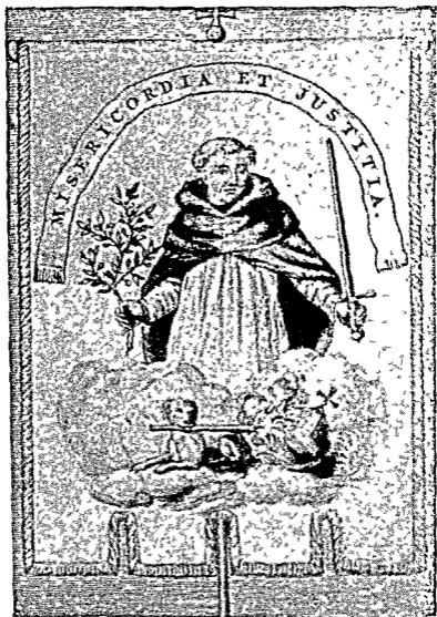
ILL. No. 1. Standard of the Goa Inquisition, bearing the image of St. Dominic, founder of the Inquisition.