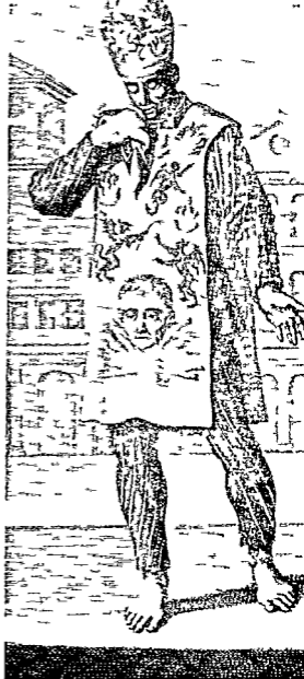
ILL. No 6 Samarrā , with a portrait of the wearer placed on burning fire brands and surrounded by demons and Carocla , conical cap. Dress worn by those who were condemned to be burnt alive (see pt II, pp 52-53)