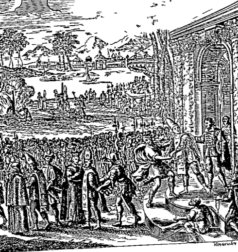
No 10. Campo Sancto Lazaro in Goa, where condemned prisoners were burnt. (See pt. II, p. 60).