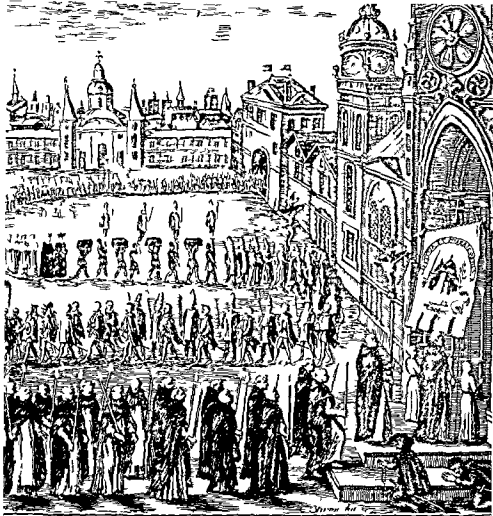
ILL. No 8 Procession to the Auto de Fe

At the head of the procession is the banner of the Holy Office. Then follow the Dominicans. Next follow the prisoners, the least guilty marching first. Each prisoner holds a taper and has his Godfather by his side. Then follow effigies of the dead prisoners carried on poles, each accompanied by a chest containing the bones of the deceased. (See pt II, pp 53-56)