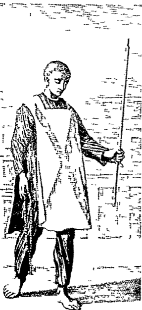
ILL. No 7 Sar ber sto with the Cross of St Andrew. Dress worn by those who had avoided death by self accusation (See pt II p 52)