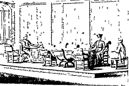
ILL. No 2 Hall of the Inquisition