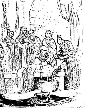
ILL. No. 4. Torture of Petro or Water torture. (See pt. I, pp. 154-8).