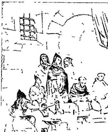
ILL. No 3 Figure by fire